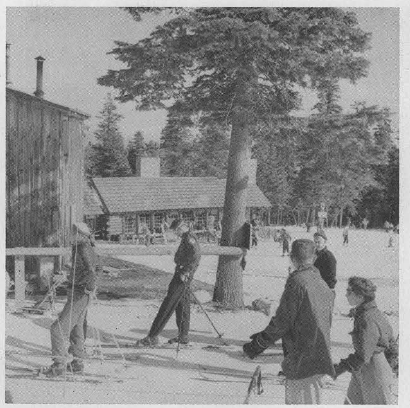
A LINE OF SKIERS wait their turn by the La Madera ski tow. The handsomely rugged Lodge is in the background. Days like this are what local ski enthusiasts wait for all year 'round.